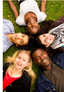
The leaders of tomorrow.